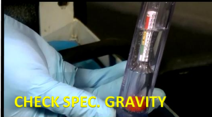
CHECK SPEC. GRAVITY